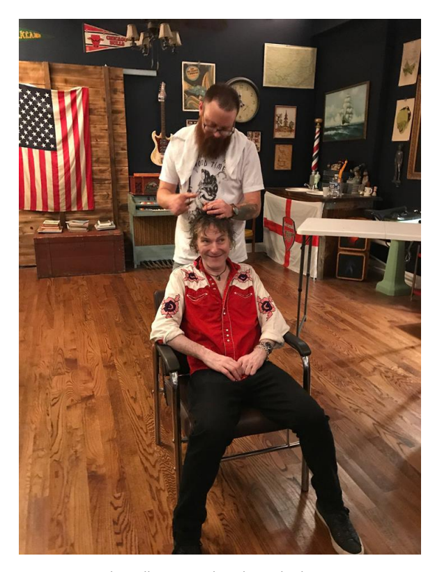
At the Bully Trap Barber Shop, Charleston WV

July 29 - Buffalo NY (Community Beer Works)