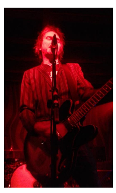
Bash & Pop March 1, 2017 Doug Fir Lounge (Portland, OR)