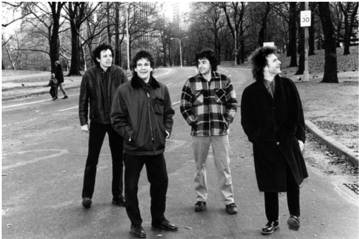
The Replacements, circa 1987-1989

send an email saying "subscribe skyway" (and hello) to mattaki@gmail.com